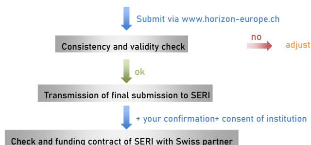
Figure 1: Process overview: flow chart of application for direct funding of a HEU participation as an AP from Switzerland.