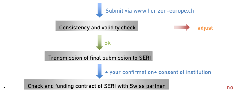
Figure 1: Process overview: flow chart of application for direct funding of a HEU participation as an AP from Switzerland.